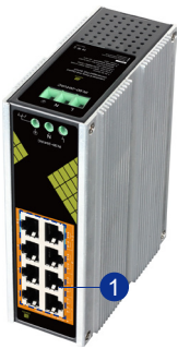
1 1000Mbps PoE Ports