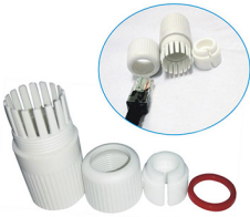
GNT-5313Cover Four set waterproof Cover (Optional)