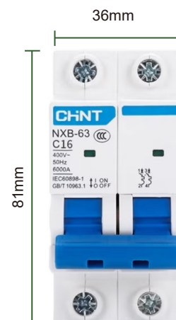
Miniature Circuit Breaker Brand: CHINT Model: NXB-63 C16 Number of Poles: 2P Rated Current: 16A Rated Voltage: 400V~ Thermal Magnetic Release: C Mechanical Life: 20,000 cycles Electrical Life: 10,000 cycles Short-circuit Breaking Capacity (Icn): 6000A Dimensions (W*H*D): 36*81*77.8mm Installation: DIN-rail mounted