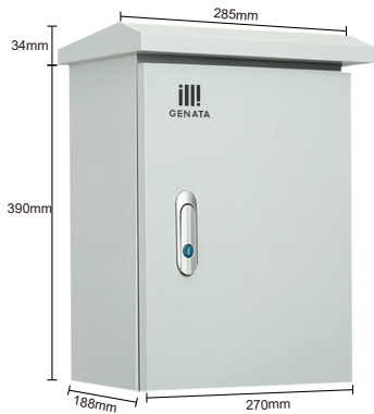
Model: GNT-IDC45F4 Size(L*W*H): 285mmx188mmx424mm